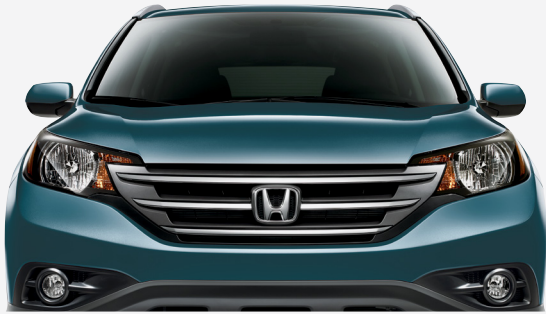
MOUNTAIN AIR METALLIC