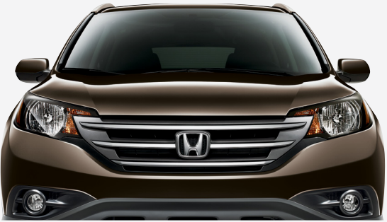
KONA COFFEE METALLIC