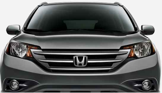
POLISHED METAL METALLIC