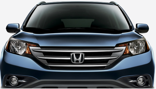
TWILIGHT BLUE METALLIC