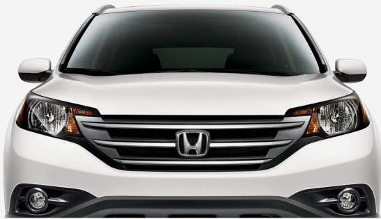
WHITE DIAMOND PEARL