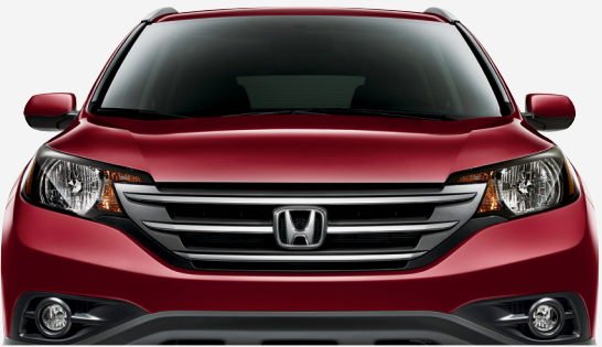
BASQUE RED PEARL II