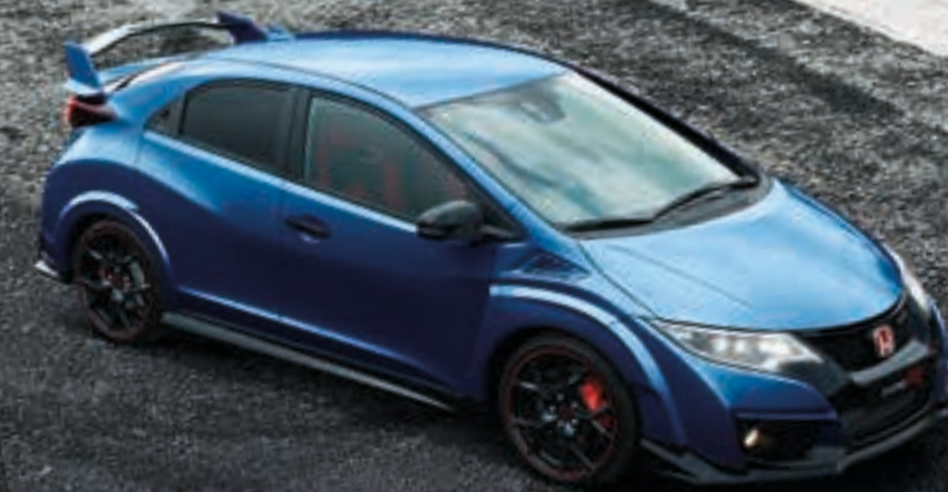
Brilliant Sporty Blue Metallic