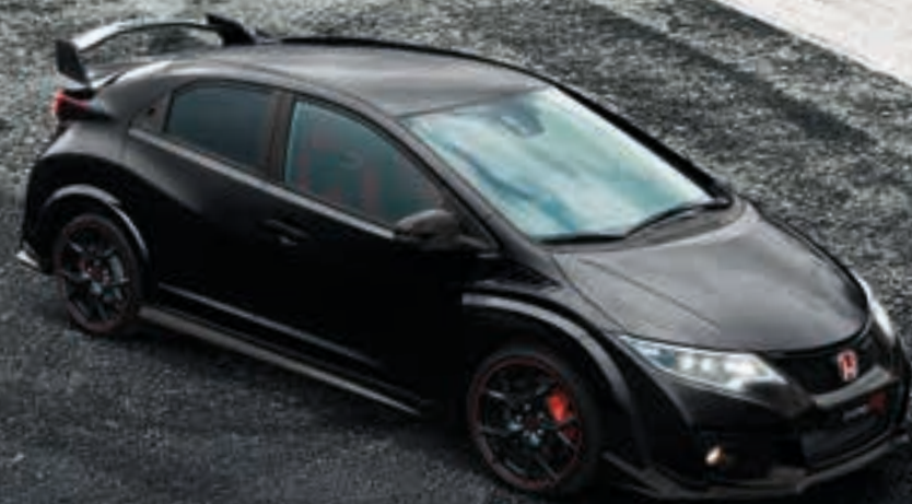
Crystal Black Pearl