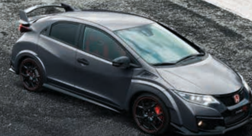
Polished Metal Metallic