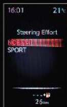
STEERING FEEL Select sport or normal to change the steering weight.