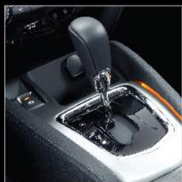
LEATHER SHIFT LEVER 皮製波棍

配備高輸出和高燃油效率的新世代全鋁合金MR20DD高效直噴引擎，最大馬力及扭力分別為144PS及20.4kg-m。先進XTRONIC CVT M-7 (電子智能無段變速波箱附手動7速「+/-」模式) 和嶄新的ASC (Adaptive Shift Control) 智能轉波系統，令轉檔更順暢，加速更凌厲。