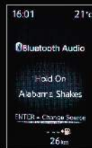
AUDIO Get full details on your favorite artists and music you enjoy while in motion.