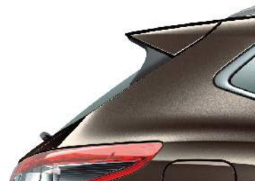
Bronze (CAP) <PM>