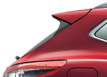
Magnetic Red (NAJ) <PM>