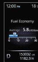
FUEL ECONOMY 節能資訊