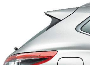
Silver (KY0) <M>