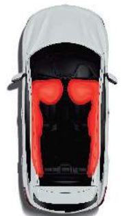
8 SRS Airbags

全車8個安全氣袋配合前排預索式安全帶，可有效減低撞擊所帶來的損害，保護駕駛者及乘客。