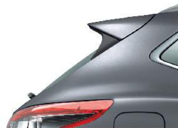
Dark Metallic Grey (KAD) <M>