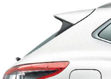
Brilliant White Pearl (QAB) <3P>