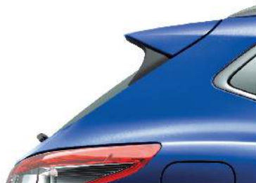
Ink Blue (RBN) <PM>