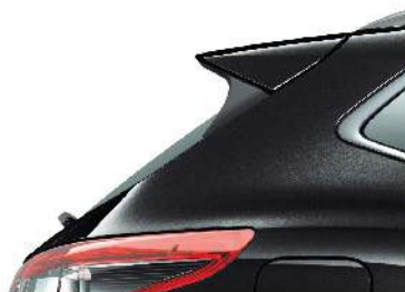
Black Metallic (Z11) <M>