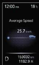
AVERAGE SPEED 平均車速

揮灑自如，一切盡在掌握。所有行車資訊將透過先進駕駛輔助顯示屏以圖像即時傳達。設計簡約，一目瞭然，助您掌控全車。