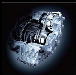
ADVANCED XTRONIC CVT-M-7 with 7-speed manual shift mode 電子智能無段變速波箱附手動7速「+/-」模式