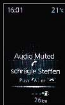
CALLER ID Check your calls while keeping your eyes on the road.