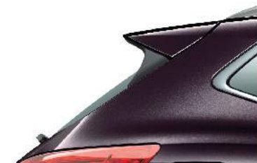
Night Shade (GAB) <PM>