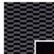
VISIA & ACENTA GRADES BLACK MESH TRICOT