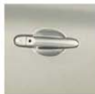
PEARL WHITE QX1