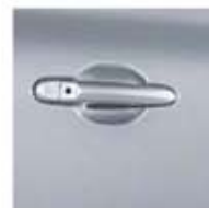
UNIVERSAL SILVER K23