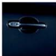
SAPPHIRE BLACK B20