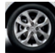
15" alloy wheels