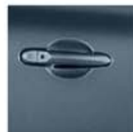
TUNGSTEN GREY FAA