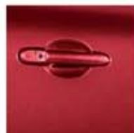
SHIRAZ RED AY4