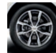
15" diamond cut alloy wheels