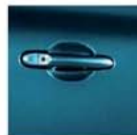
PACIFIC BLUE RBK