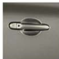
PLATINUM SAGE EAQ