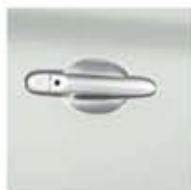
ALABASTER WHITE QM1