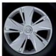
14" STEEL WHEELS