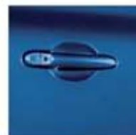
ATLAS BLUE B53