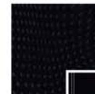
TEKNA GRADES BLACK SUEDE EFFECT