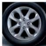
15" ALLOY WHEELS