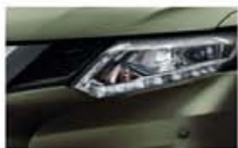
Titanium Olive - M