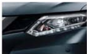
Haptic Blue - M