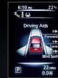
NISSAN SAFETY SHIELD TECHNOLOGIES