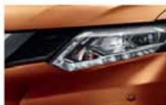
Copper Blaze - M