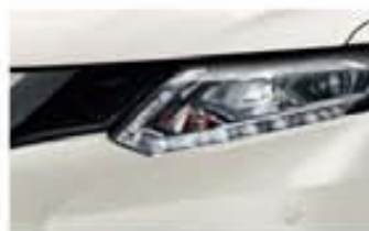
Storm White - P