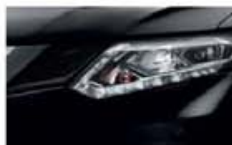
Ebisu Black - M