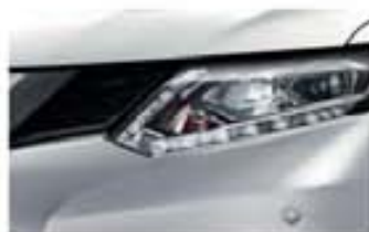
Universal Silver - M