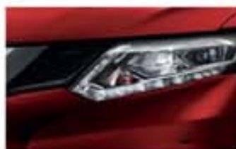
Chili Pepper - S