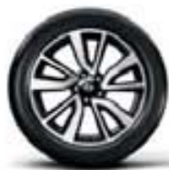
19" alloy (machine cut)