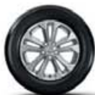
17" alloy (silver painted)