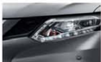
Gun Metallic - M