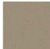
LEATHER WITH PERFORATION - CREAM