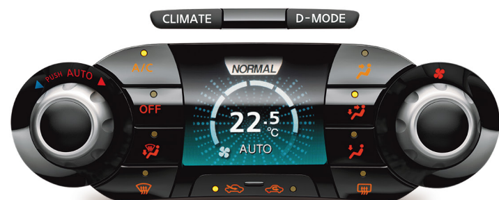
Shown in Climate Interface