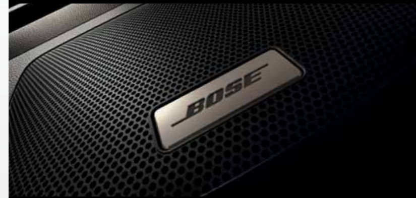
13 PREMIUM BOSE® SPEAKERS