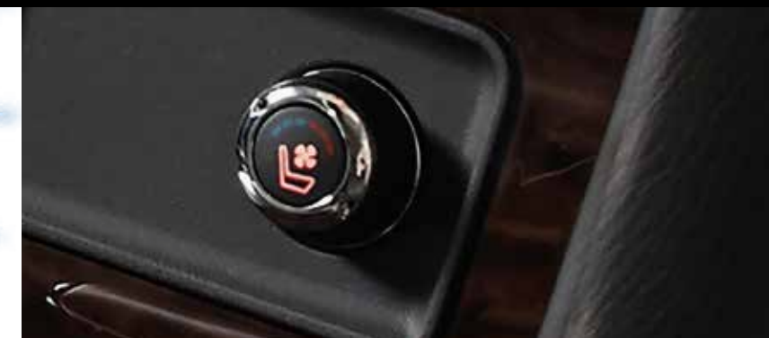
HEATED AND COOLED FRONT SEATS