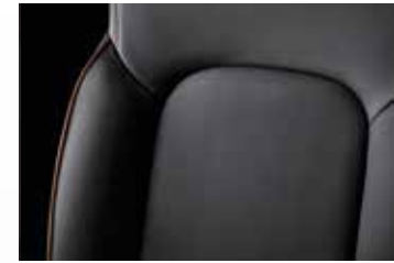
Interior black leather accented seat trim*.

Minor trim variations may occur from time to time. *Leather accented features and upholstery may contain synthetic material.