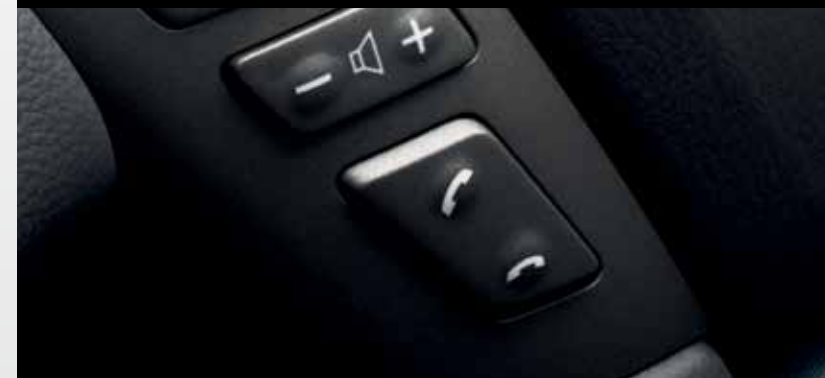
BLUETOOTH® HANDSFREE PHONE/AUDIO SYSTEM CONTROLS