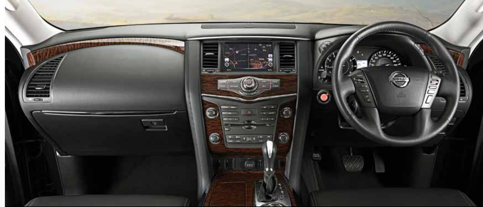
Ti INTERIOR SHOWN

*iPod is a registered trade mark of Apple Inc.