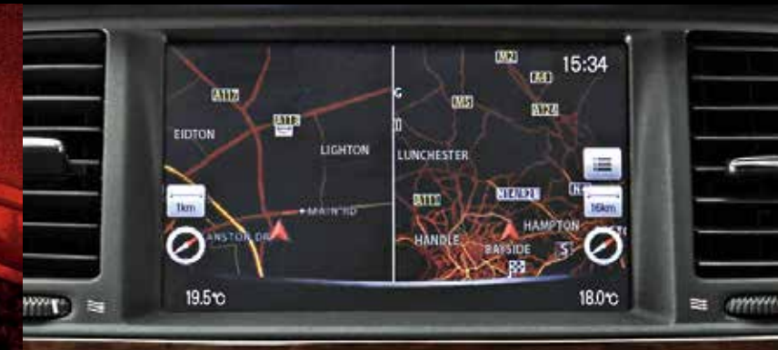
SATELLITE NAVIGATION WITH 8" COLOUR TOUCH SCREEN