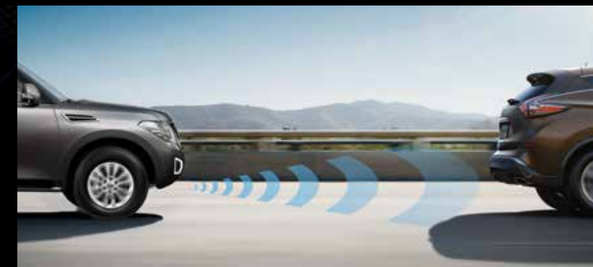
INTELLIGENT CRUISE CONTROL (ICC)