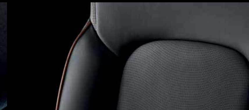
LEATHER ACCENTED* SEAT TRIM