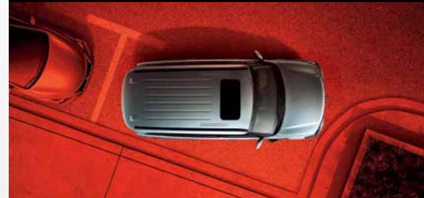
INTELLIGENT AROUND VIEW MONITOR WITH MOD