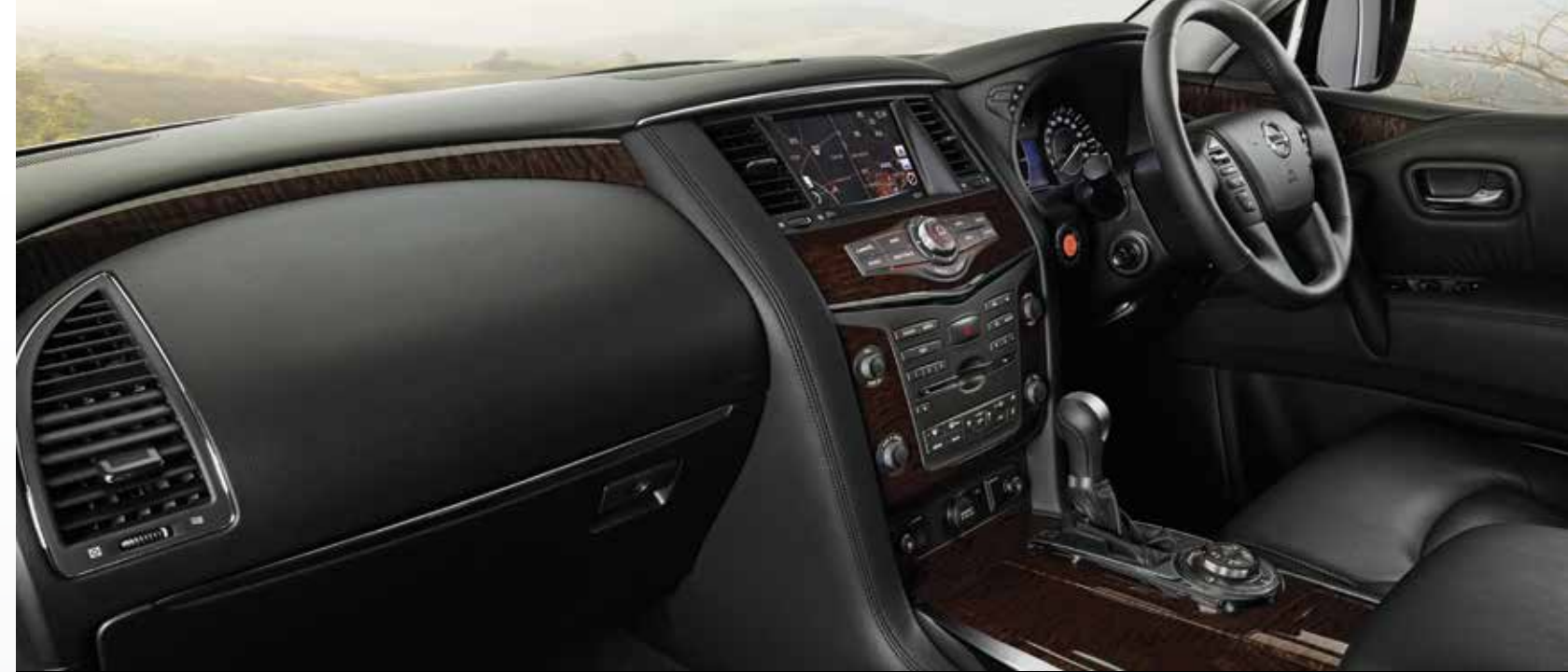
TI-L INTERIOR SHOWN