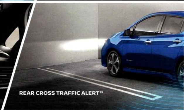
REAR CROSS TRAFFIC ALERT 13