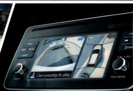
INTELLIGENT AROUND VIEW® MONITOR 1