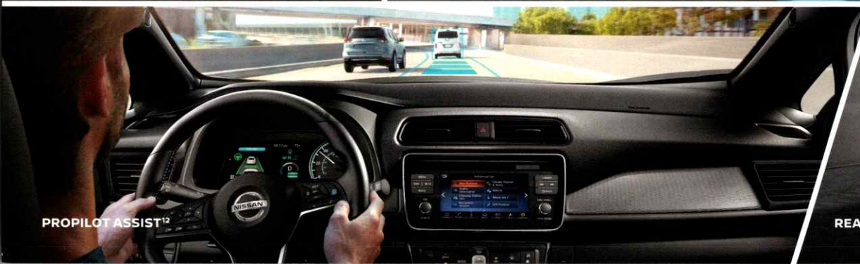
PROPILOT ASSIST 12