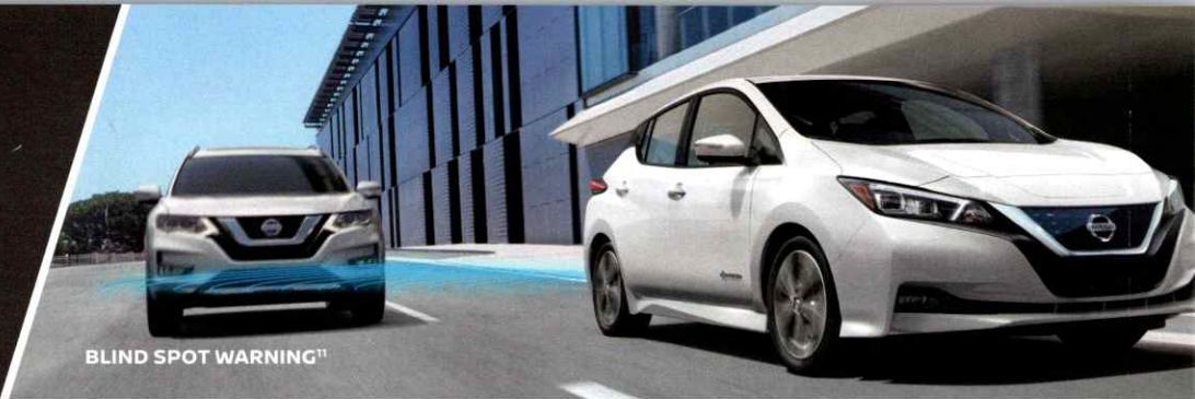
BLIND SPOT WARNING 11